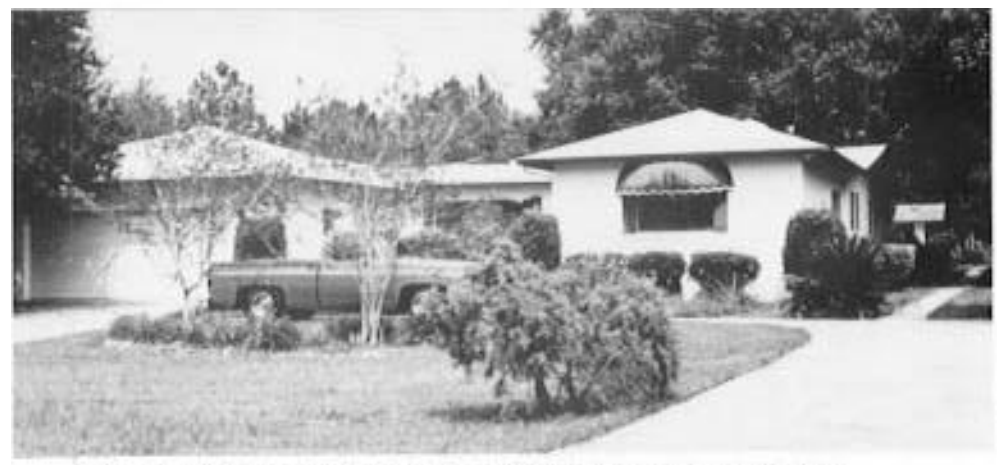
Tommy and Eunice Zeigler's house, 75 Temple Grove Drive in Winter Garden, as it appears in 1992.