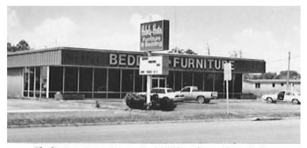
The furniture store as it appears in 1992. The pickup truck is parked in the same place the Edwards's sedan occupied on the night of the murders.